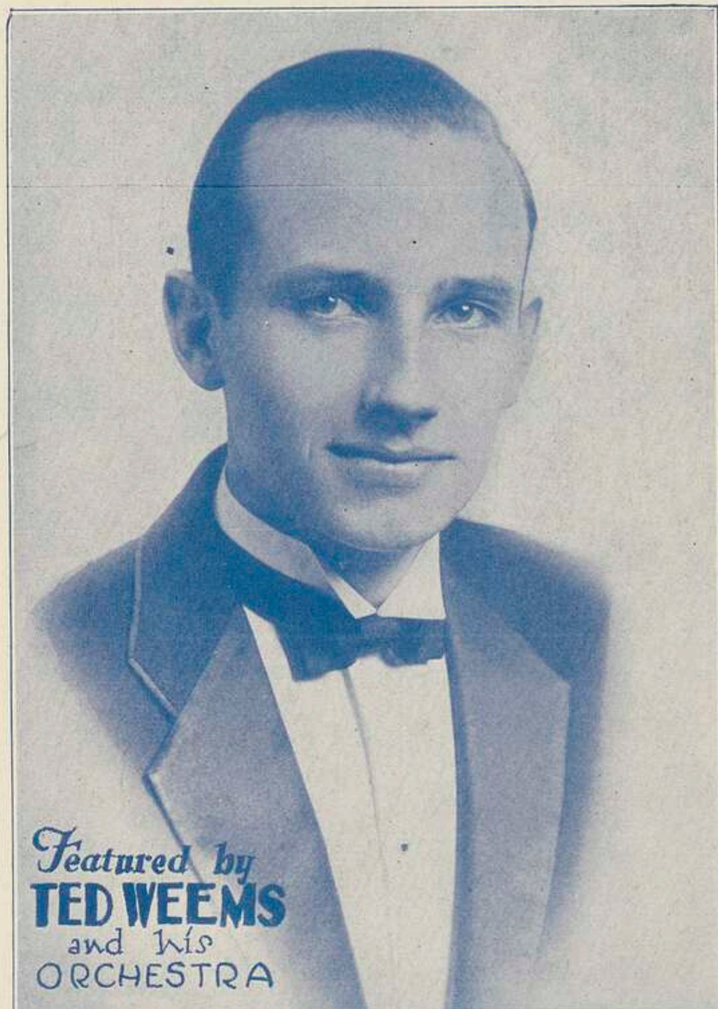
Featured by TED WEEMS and his ORCHESTRA