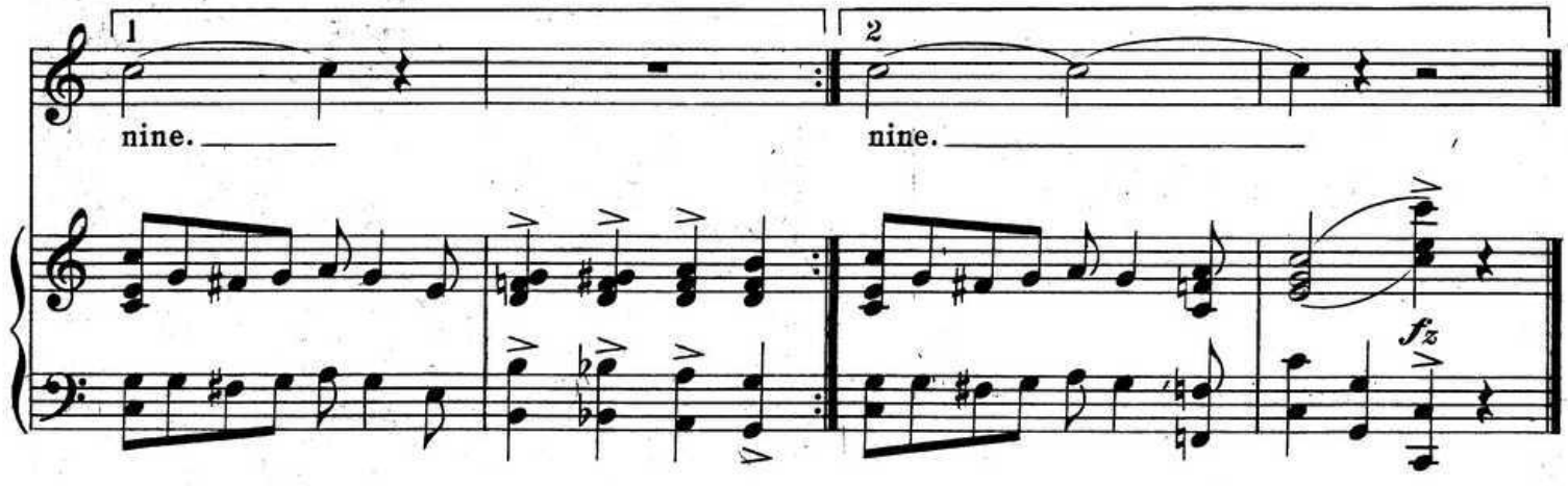
Meet Me To Night At Nine