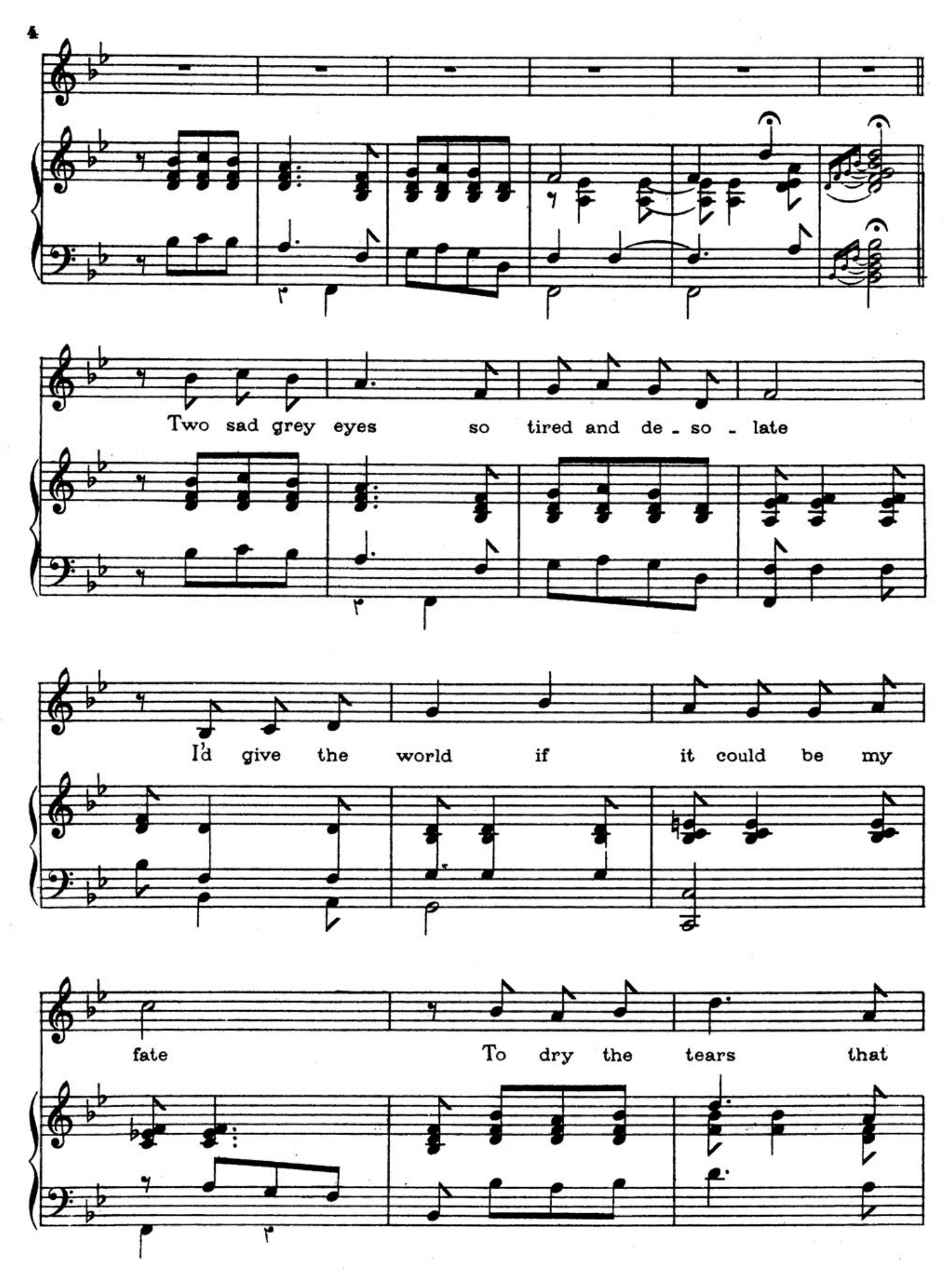
Two eyes of grey.