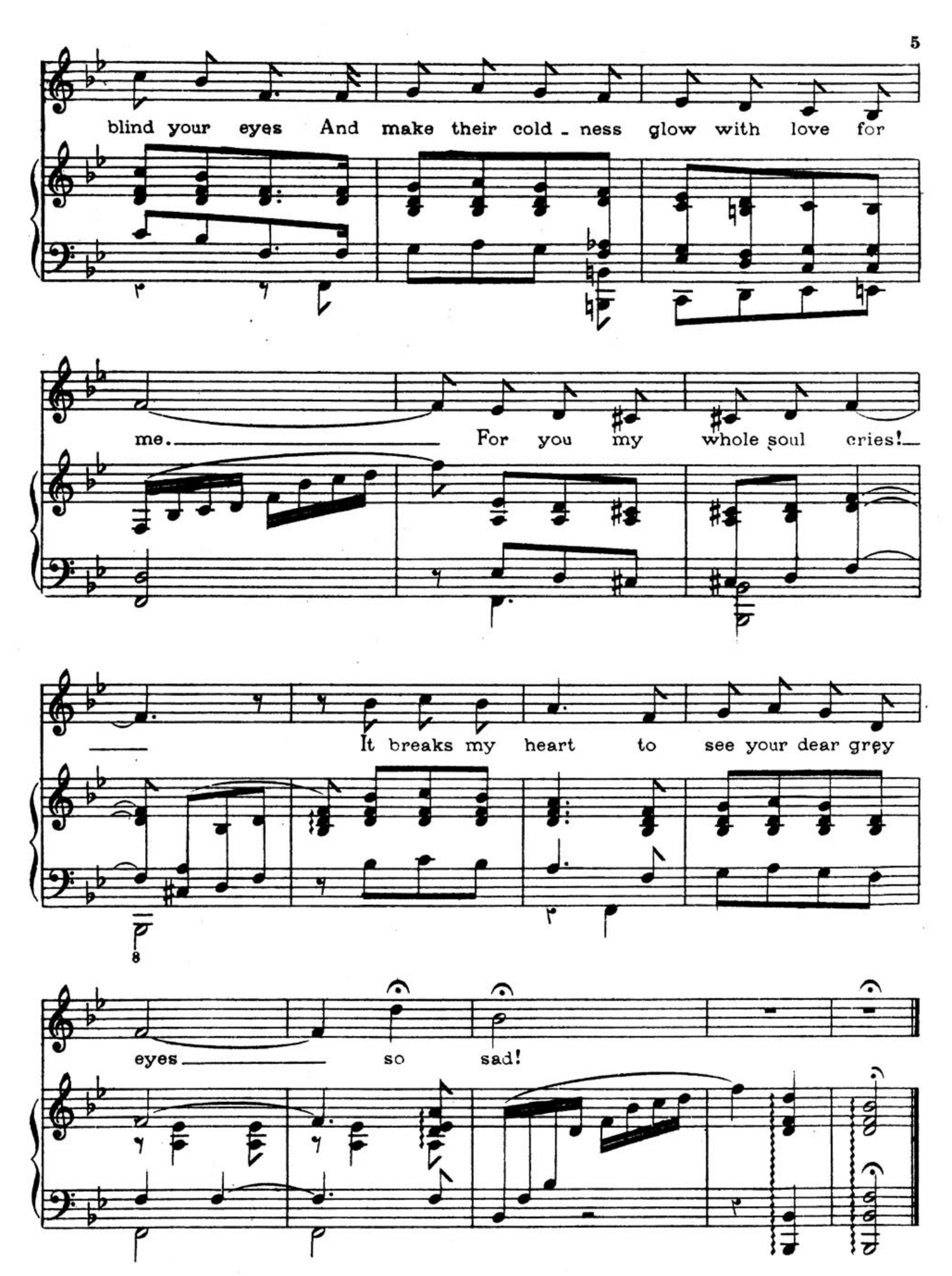
Two eyes of grey.