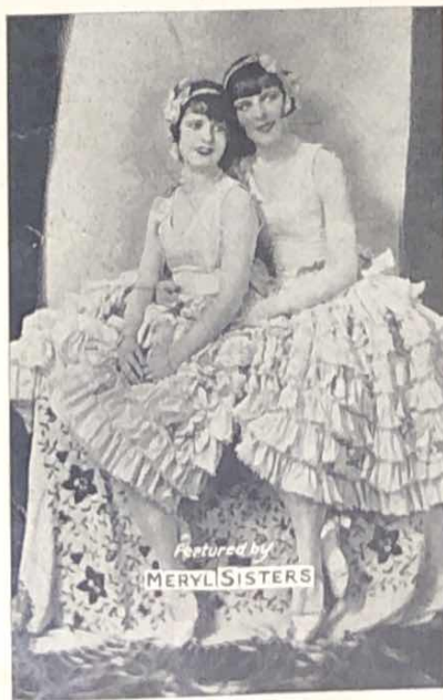
Featured by MERYL SISTERS