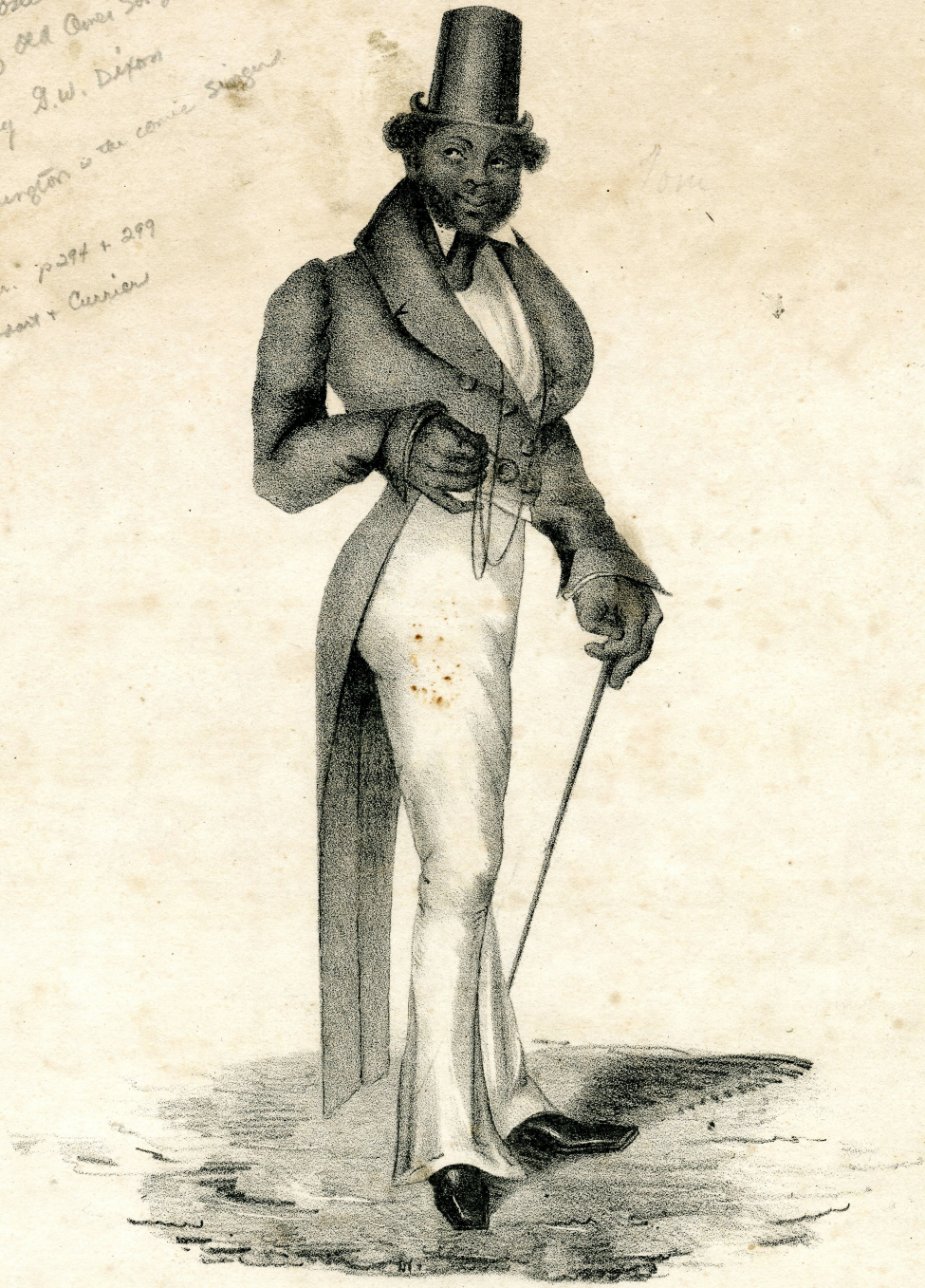
Litho of Endicott