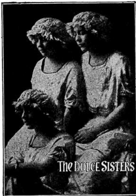
The DOLCE SISTERS