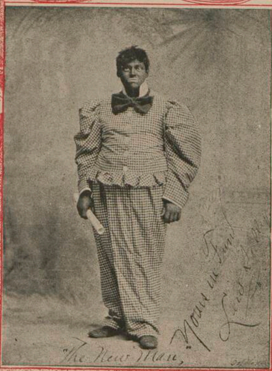
The New Man, Yours in Spirit Lew Jully