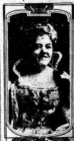
MISS MARIE CAHILL PERFORMING