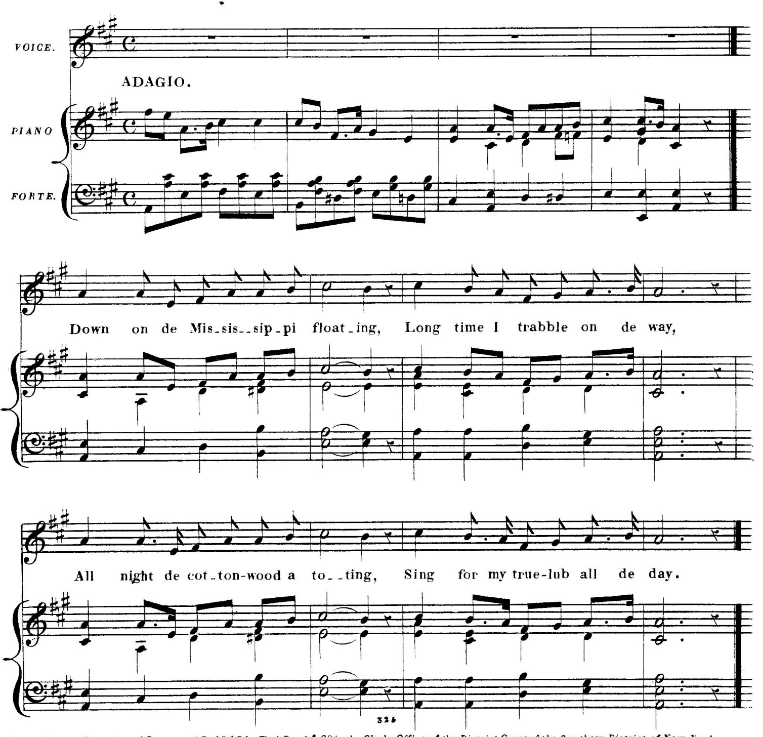
Entered according to Act of Congress A.D. 1849. by Firth Pond & C? in the Clerks Office of the District Court of the Southern District of New York.

Written and Composed by Stephen C Foster.