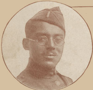
LIEUT. NOBLE SISSLE